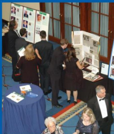
State Chapter Induction Banquets