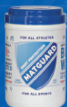
Body Wipes 65ct. Canister